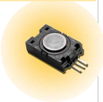
Figure 6: Infusion pump load cell to detect occlusion