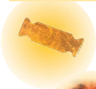
Figure 1: Miniature Piezo film sensor enlarged about 10x

The most complicated sensors are implantables, followed by sensors used in catheters (through incision), sensors used in body cavities, sensors that are external but come in contact with body fluids, and sensors for external application. In this article, I describe sensor specifications for each of these levels and give examples of current devices being used.