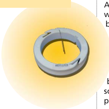
Figure 3: Temporary temperature sensor catheter probe

A pair of matched thermistors can be attached to the tip of a catheter, which can be guided to different locations of the heart to measure blood flow. Either they can be heated through the coil or flushed with cold saline to measure blood flow rates. When flushed with cold saline, the first sensor gets cooled more than the second because the blood flow warms up the saline that reaches the second sensor. Since the two temperature sensors are separated by a known distance and the temperature and the volume of saline is controlled, the blood flow can be calculated by reading the difference in the outputs of the two sensors. When cold saline is used, these thermistors don't require external power. Figure 3 shows this type of sensor.