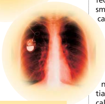
Figure 2: Pacemaker X-ray

The power requirement is one of the major challenges for working with implantable sensors. Sensors that can function with no power are perfect, but there are few in the market. Piezoelectric polymer sensors are small, reliable, require no power and last for a long time. Such sensors can be used in pacemakers that monitor activities of the patient.