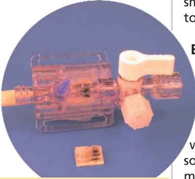
Figure 5: Disposable blood pressure sensor

disposable blood pressure sensors, which are exposed to body fluids, provide continuous monitoring